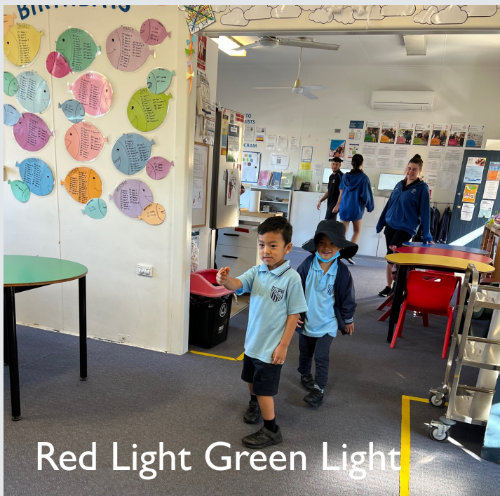
Red Light Green Light