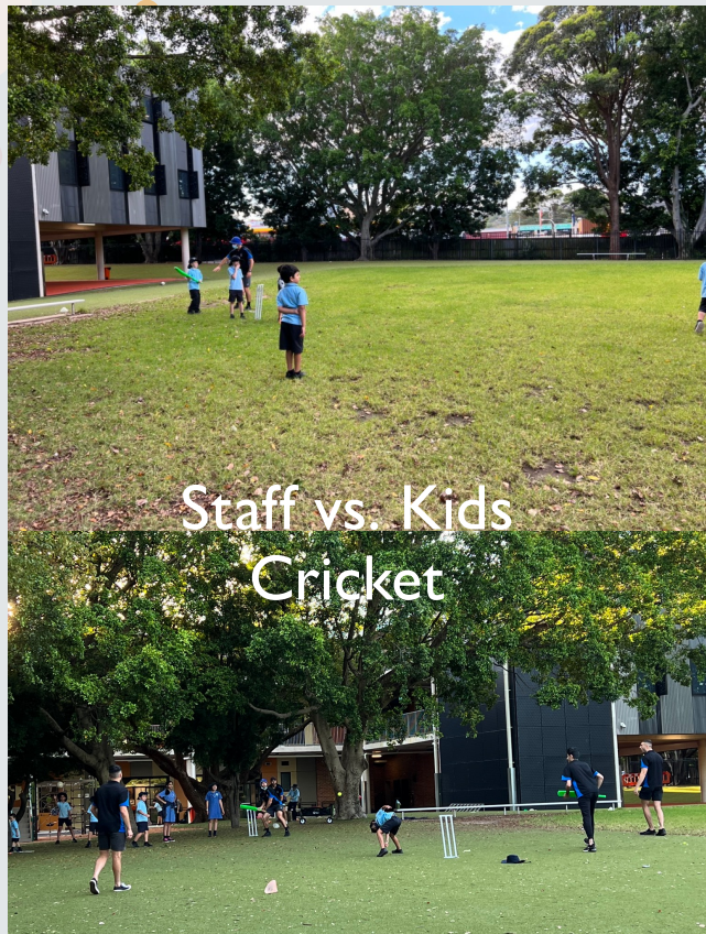
Staff vs. Kids Cricket