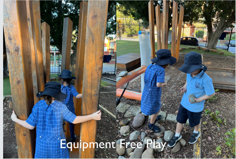
Equipment Free Play