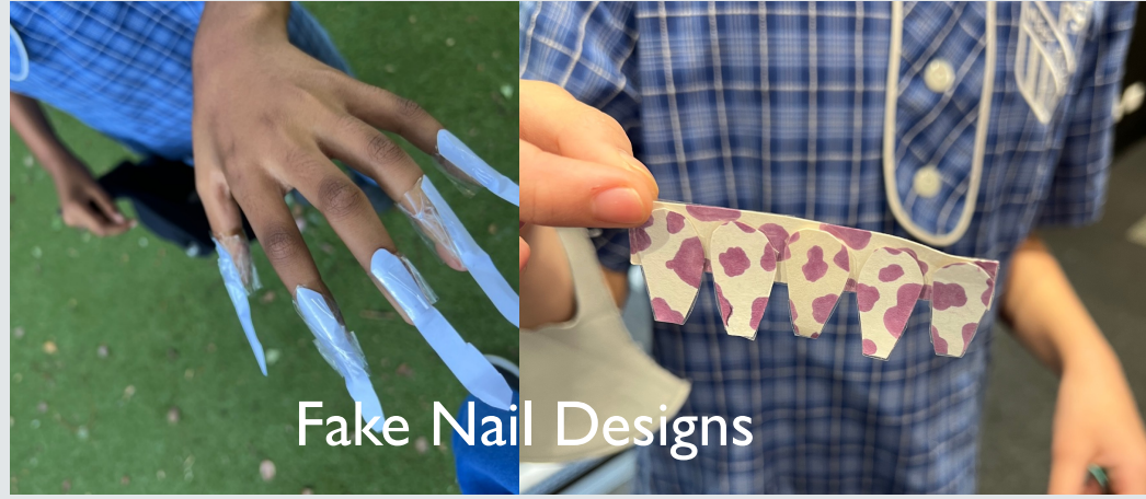
Fake Nail Designs