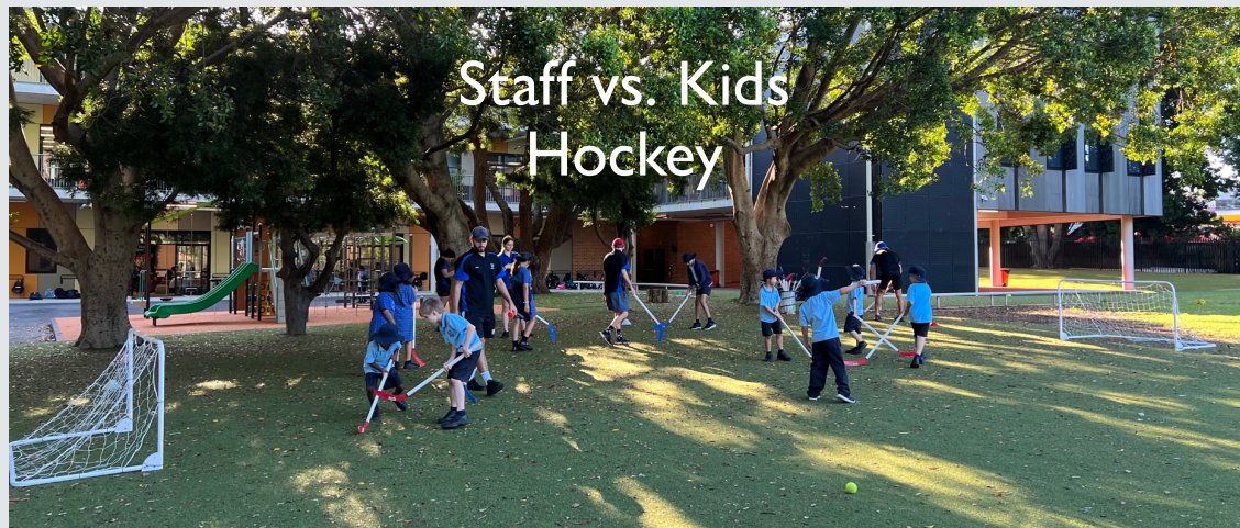
Staff vs. Kids Hockey